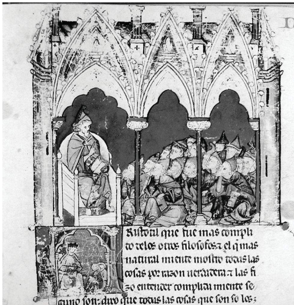
Illustration 1: Alfonso receiving the Lapidary. Real Biblioteca del Monasterio de El Escorial, MS. h.I.15, fol. 1r.